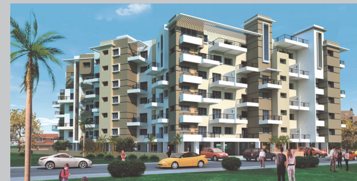
Ranjana Residency- 2