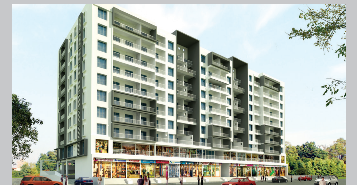
Vishwkarma, Prestige Phase 3