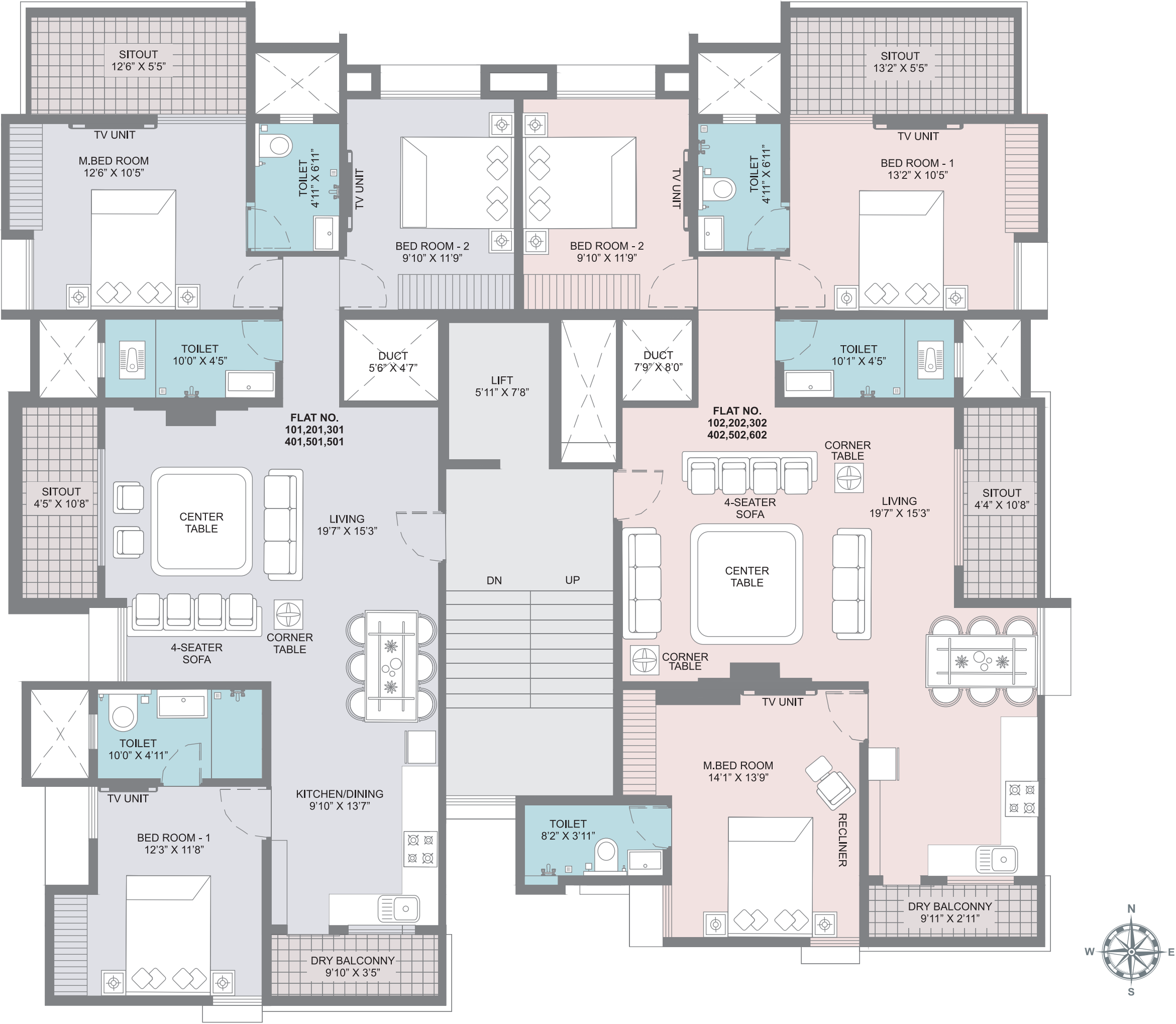
ODD/EVEN FLOOR PLAN 1 st , 2 nd , 3 rd , 4 th , 5 th , 6 th Floor Plan