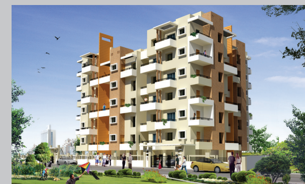
Ranjana residency - 1